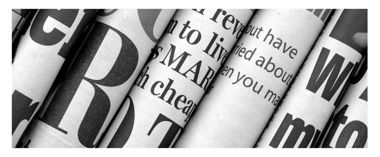
To place a notice visit www.thegazette.co.uk/wills-and-probate/place-a-deceased-estates-notice