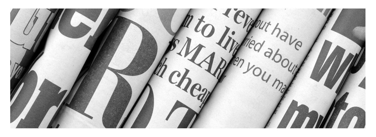
To place a notice visit www.thegazette.co.uk/wills-and-probate/place-a-deceased-estates-notice