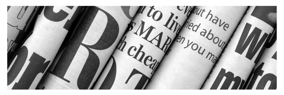
To place a notice visit www.thegazette.co.uk/wills-and-probate/place-a-deceased-estates-notice